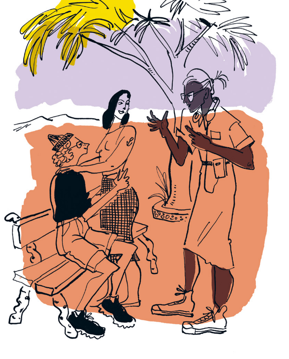
GUIDELINES FOR DOING INTIMATE SCENES IN CAMERA WORK